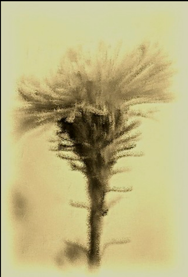
Photo Manipulation of images supplied by local photography club to enable individuals to create unique works of art