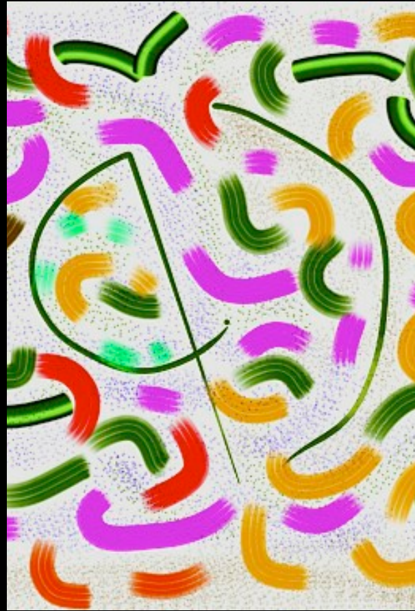
Drawing and art apps with a simple user interface for the production of impressive works of art

Art and creativity are all around us but most people don't have the confidence to explore the creativity that exists within. We feel we need to be a professional artist or photographer to participate in these activities. With new technology this is no longer the case and the tools are now available that remove the complexity of art creation and opens up this area to everyone. Just using your finger and simple touch controls it is now possible to create impressive works of art whatever your cognitive abilities. There are a range of software apps from simple painting, music creation, photographic manipulation and entertainment apps. Most people believe that technology is for the younger generation but touch screen devices enables all generations to get involved.